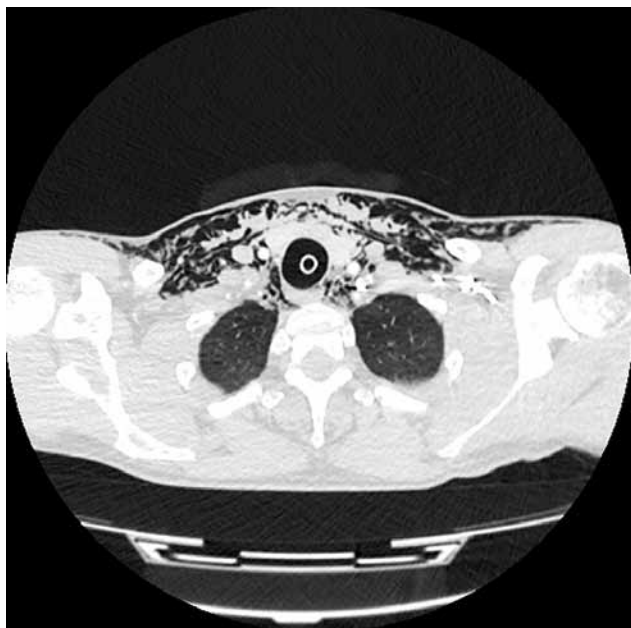
Fig. 1. Woman, 26 year, with tracheal injury. Subcutaneous and upper mediastinal emphysema

Indications for surgical interventions in neck injuries include [3]: